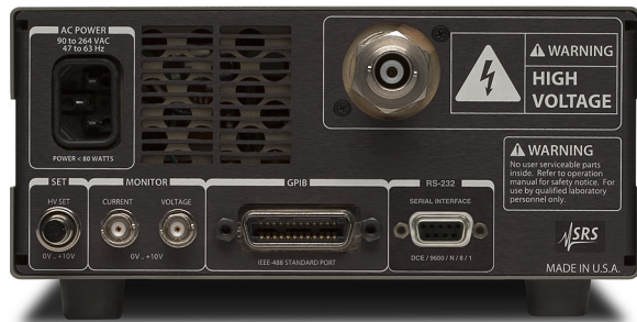
PS370 rear panel

Both GPIB and RS-232 computer interfaces are standard on all 10 W supplies. GPIB is available as an option on the 25 W instruments. All parameters can be set and read via the computer interfaces.