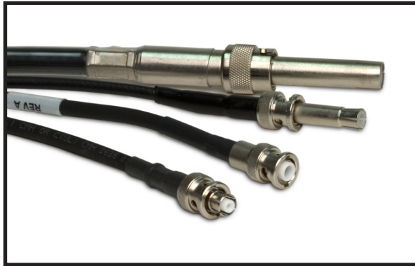
High voltage cables

Operation is simple. The parameter being adjusted or set is displayed separately and can be entered without affecting the actual output voltage. Up to nine instrument configurations can be stored and recalled at any time, making it easy to run multiple tests.