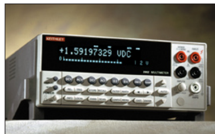
This Keithley Model 2002 DMM has 8½-digit resolution and can approach theoretical limits for sensitivity.